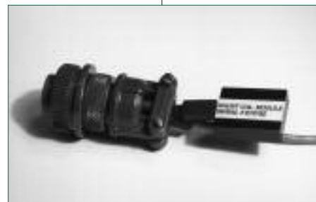
Shunt Calibration Module